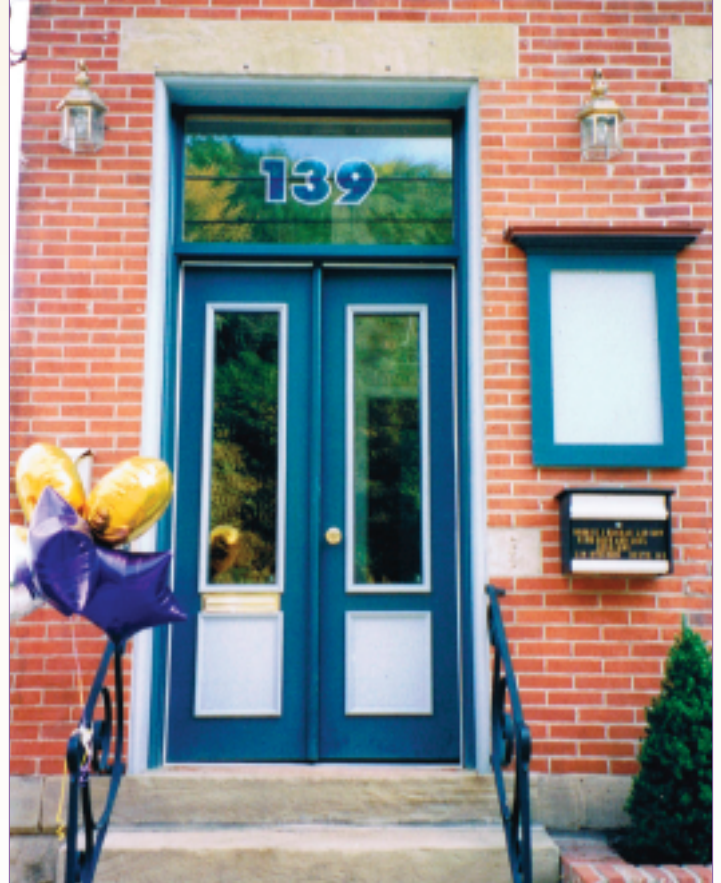
The Place for Reiki, Pittsburg, Pennsylvania.