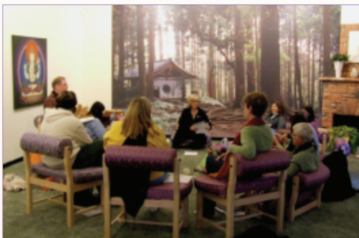
Reiki class discussion at Infinite Light Healing Studies Center.