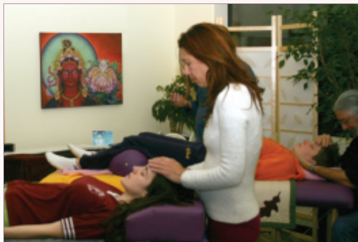
Reiki Share at Infinite Light Healing Studies Center.

planning and teaching four or five classes a month; marketing, administrating, and coordinating details and travel arrangements for retreats and events; setting up computer systems to track various details; hand selecting crystals, jewelry, and other healing tools to sell; doing sessions; a lot of writing; paper work, accounting records, phone calls, emails; working with staff; educating visitors; and handling the innumerable, necessary details of a large center.