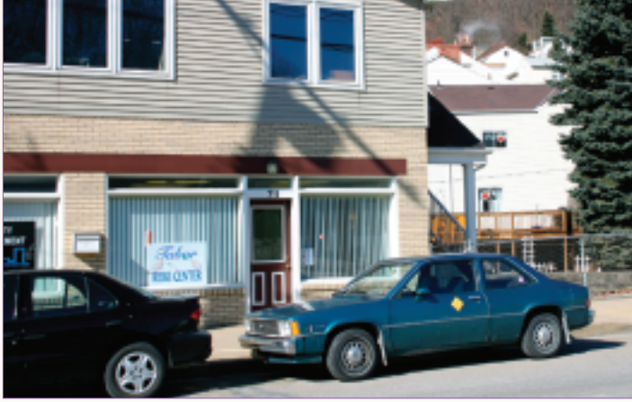
Tabor Reiki Center, Millvale, Pennsylvania.