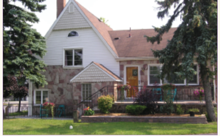
Mystic Wolf Healing Arts, Williamsville, NY.