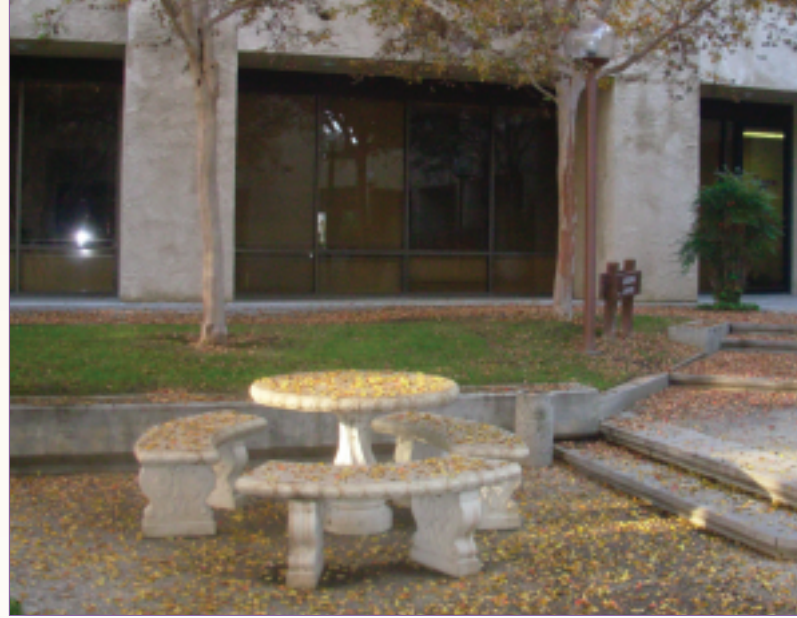
The Healing Center