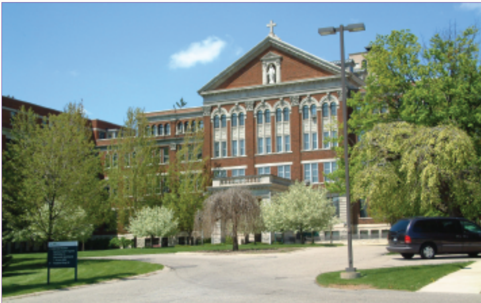
The Dominican Center at Marywood. Grand Rapids, Michigan.